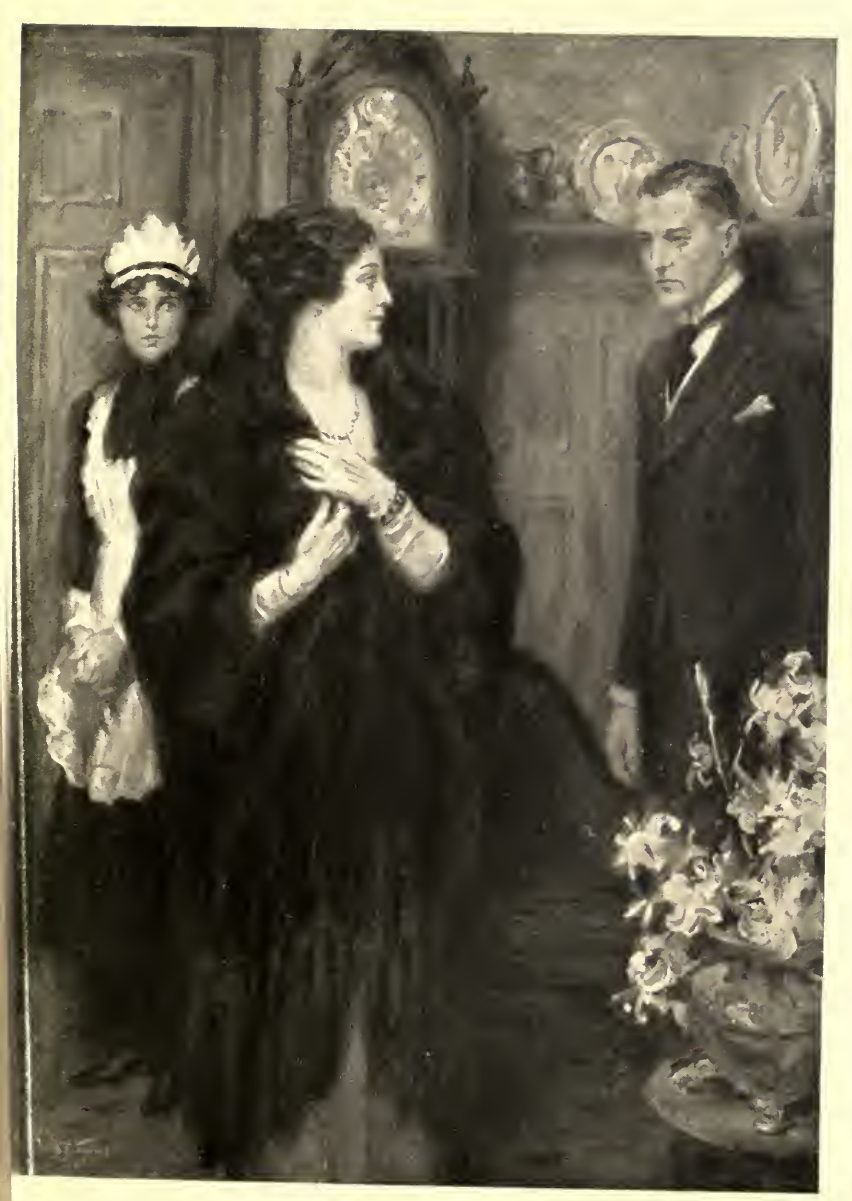
"You're no good as a butler," she whispered.